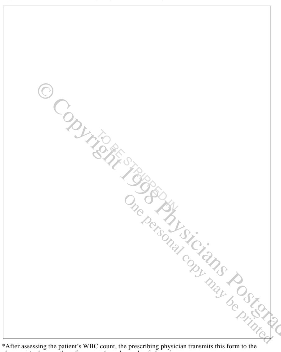
*After assessing the patient's WBC count, the prescribing physician transmits this form to the pharmacist who may then dispense a 1-week supply of clozapine.

4. Limited distribution. Each prescription for clozapine must be accompanied by a record of the current WBC and identified by the patient's initials, SSN, and date of the blood sample. The 3-part Clozaril National Registry WBC Count Reporting Form (Figure 1) is typically used for this purpose. Prescriptions may be filled only at participating pharmacy service providers registered with the manufacturer of Clozaril. A 1-week supply of medication is dispensed to patients, linked to a current WBC.