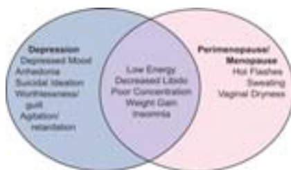
Figure 1. Symptoms of Depression and Perimenopause Often Overlap Due to Similar Neurobiological Links Between These 2 Conditions a

a Reprinted with permission from Stahl. 1