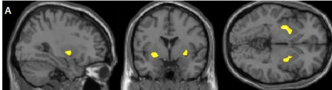
Figure 2. Regions With Positive Significant Association a Between Gray Matter Volumes and Treatment Response of Psychotic Symptoms After 6 Weeks of Treatment With Risperidone in Antipsychotic-Naïve Alzheimer's Disease Patients (N = 25) With Psychosis b