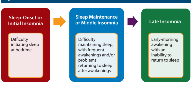
Figure 1. Manifestations of Insomnia

Based on American Psychiatric Association.<sup>1</sup>